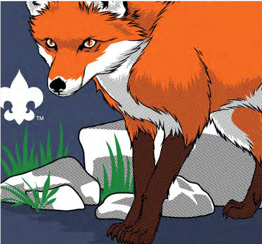
Screen Printed Image

This is a perfect example of using two ink colors with halftones to create the illusion of an additional color. In this example, a black halftone is used on top of orange ink, creating the illusion of brown ink.