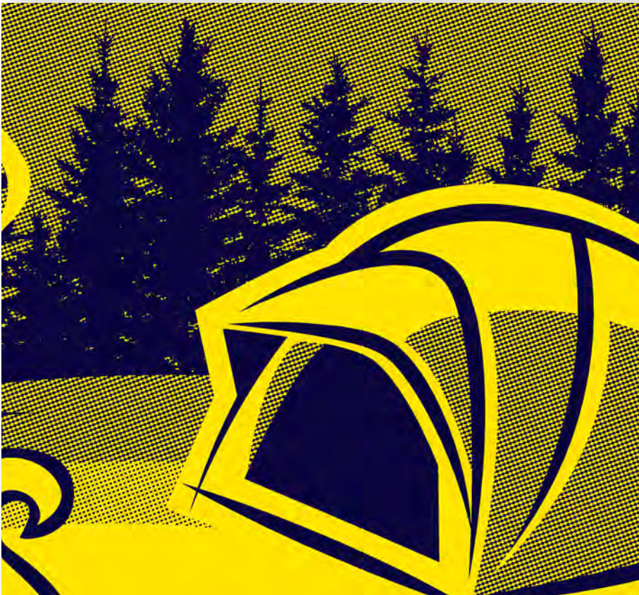
Screen Printed Image